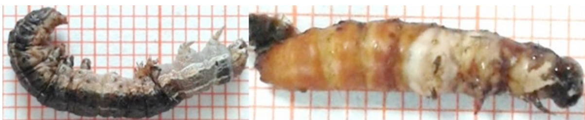
Figure 2. Biological effect of B. glabra leaves of var ‘Variegata’ against S. frugiperda , treated with 75 ppm of group K. Larvae showing an incomplete ecdysis (left) and larvae-pupae at intermediate stage (right).

The compounds identified were 30% of terpenoids type and 22% of fatty acids. The terpenoids were squalene , oxirane 2,2-dimethyl-3-(3,7,12,16,20-pentamethyl-3,7,11,15,19,(2 E )-3,7,11,15-tetramethyl-2-hexadecen-1-ol, phytol and 9,12-octadecadienoic acid (Z,Z)-, methyl ester . The compounds alkanes type were hentriacontane , nonacosane , heptacosane and pentacosane . The ketones were 3-buten-2-one , 4-(2,2,6-trimethyl-7-oxabicyclo[4.1.0]hept-1-yl)- , 2,2,6,6-tetramethyl-4-piperidone and 6,10,14-trimethyl-5,9,13-pentadecan-2-one , the phenolic compound was 2-methoxy-4-vinylphenol and the lactone type compound was 2(4 H )-benzofuranone, 5,6,7,7 a -tetrahydro-4, 4, 7 a -trimethyl .