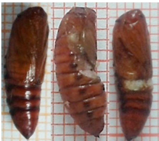
Figure 3. Pupae of S. frugiperda fed with the group K from B. glabra leaves of var 'Variegata'. Normal pupae (left), discontinuous cuticle in the ventral segment (middle); and dorsal (right).

The compound present in the group K was rich in d -pinitol and therefore it was evaluated against S. frugiperda at different concentrations from 0 to 125 ppm (Table 3). It could be observed that 50 and 75 ppm produced the best biologic effect at 7 days because the larvae did not gain weight and these treatments K50 and K75 ppm were highly statistically different with respect to the control ( p = 0.001 ). In all experiments after 7 and 14 days there were no significant difference among treatments (Kruskal Wallis H = 55.937 ; df = 10 and H = 39.86 , df = 10 , respectively). In the treatment with 75 ppm of group K , malformations were observed in the larvae after two months and they did not development into pupae. The larvae showed an incomplete ecdysis and 30 % of the population remained in the larvae-pupae intermediate stage (Figure 2).